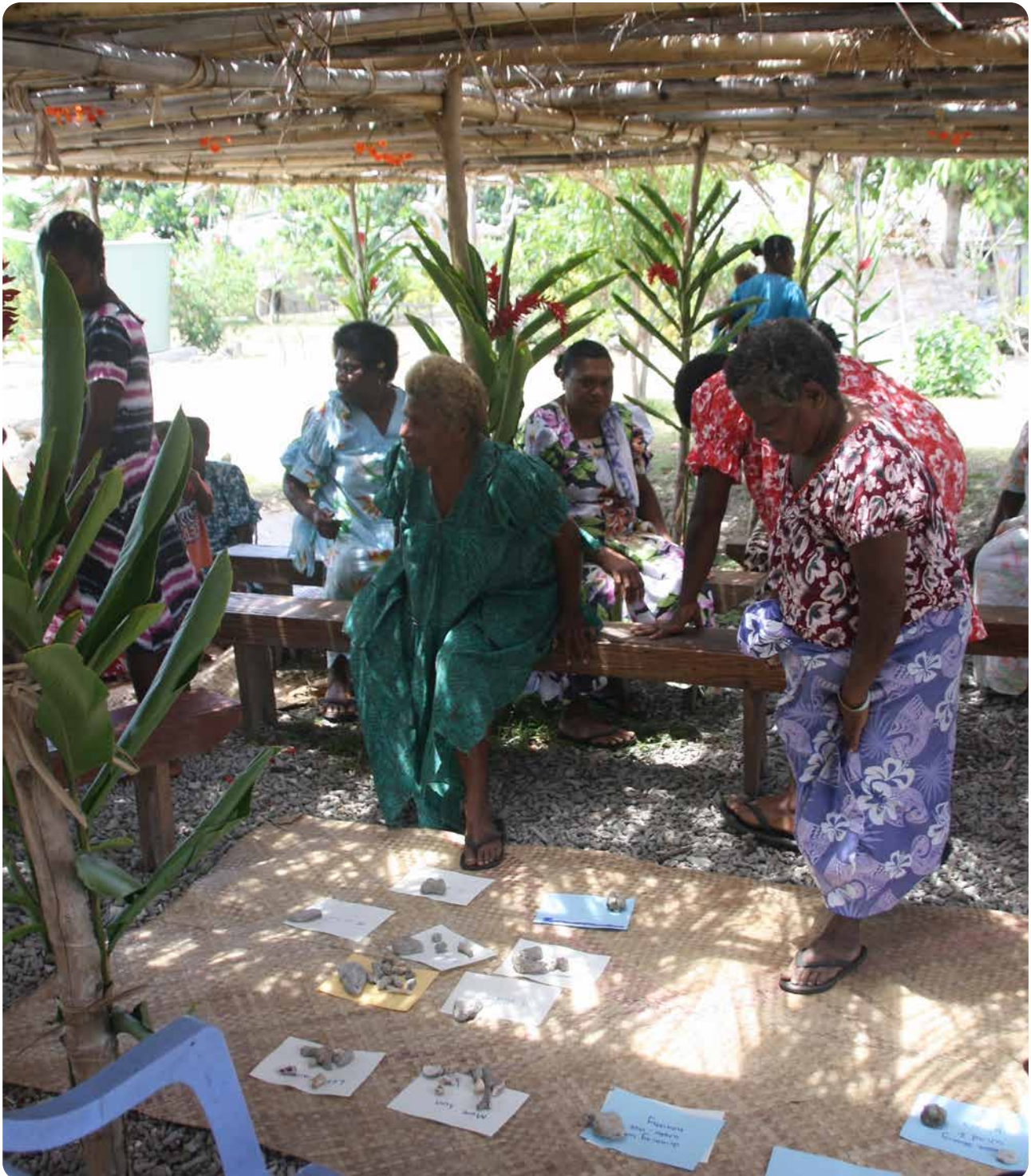
Women from Wala Island, Vanuatu, participate in a focus group discussion about community resilience (November 2019).

Women's Resilience to Disasters (WRD), UN Women, and Australian Aid. (2022). Pacific approaches to gender, disaster response and supporting resilient communities: Pacific preparatory webinar for the Asia and Pacific Ministerial Conference on Disaster Risk Reduction [webinar transcript]. https://wrw.unwomen.org/sites/default/files/2022-09/Webinar%20report_Resilient%20Pacific%20communities_v2.pdf