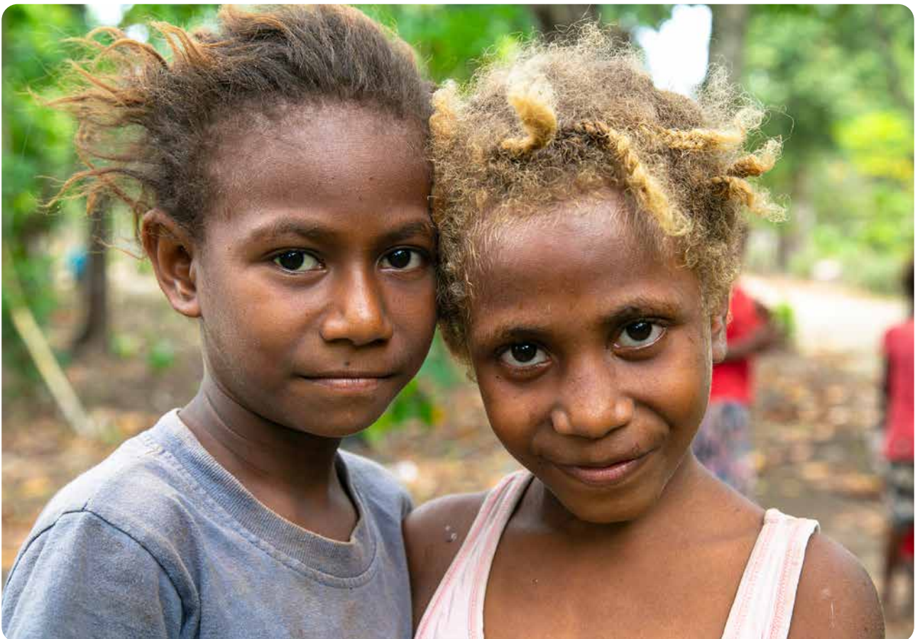
Local girls on Rah Island in Vanuatu.

Increased leadership and participation of diverse women (including young women, women with disabilities, and those who are marginalized) in disaster contexts is ensuring gender-equitable and accessible response and recovery resources. For example, the Shifting the Power Coalition programme has a greater focus on promoting diverse women's leadership at different levels to genuinely integrate women's voice at different levels. While the examples provided above are encouraging and demonstrate progress, perceptions of gender in the Pacific are primarily binary, with greater progress needed to extend inclusion to gender and sexual minorities (see more on emerging gaps later in this report).