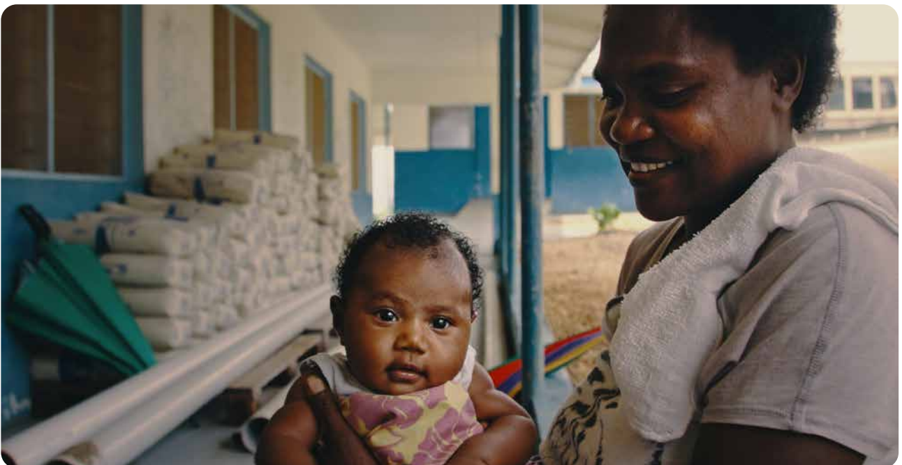
Melanesian woman with her child waiting at the local health centre in Vanuatu.

The leadership and decision-making capacities of individual WIN DRR members have been enhanced to lead and partake in decision-making to prevent, prepare, and recover from disasters. Collaborating with and supporting governing institutions to adopt more inclusive practices and policies has translated to more inclusive disaster risk management.