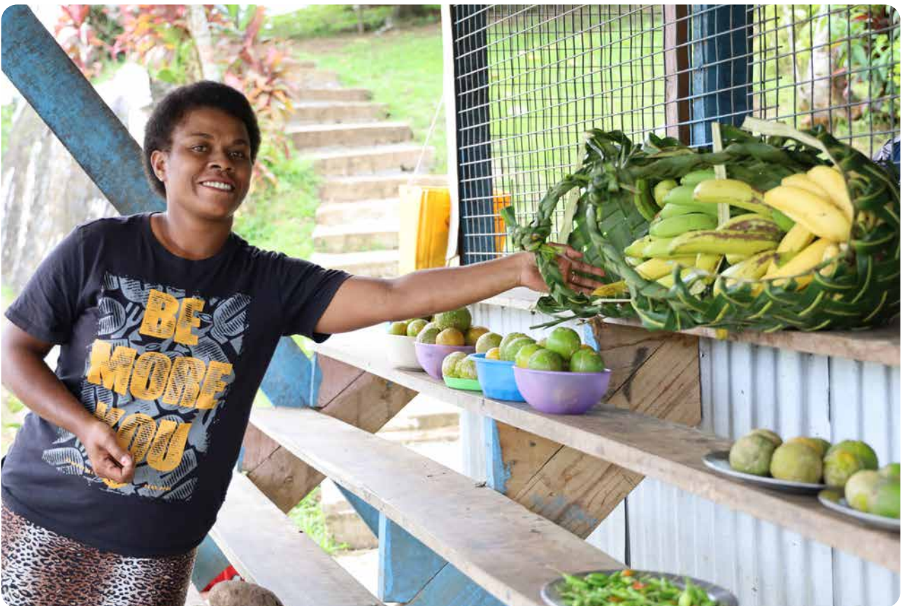
At the market near Suva, Fiji.