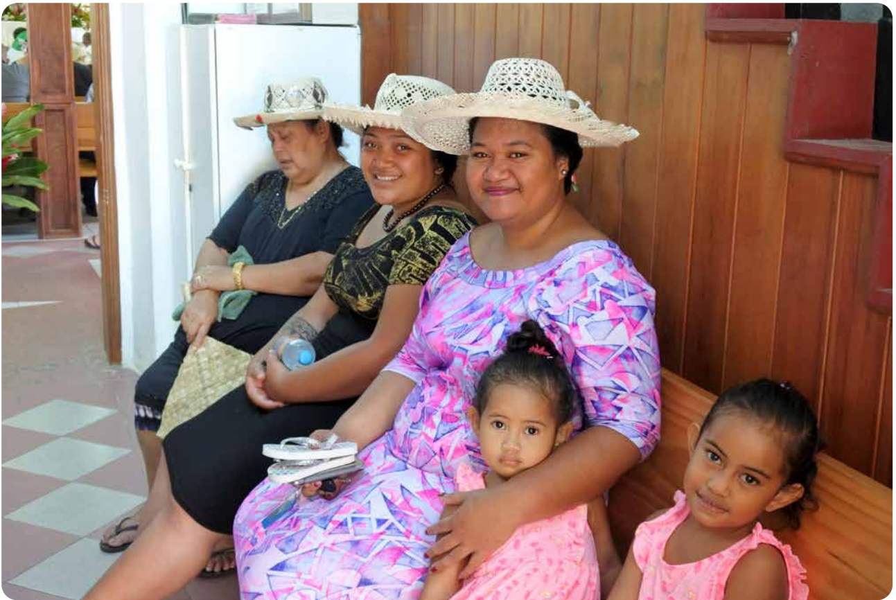
Women and girls at church in the Cook Islands.