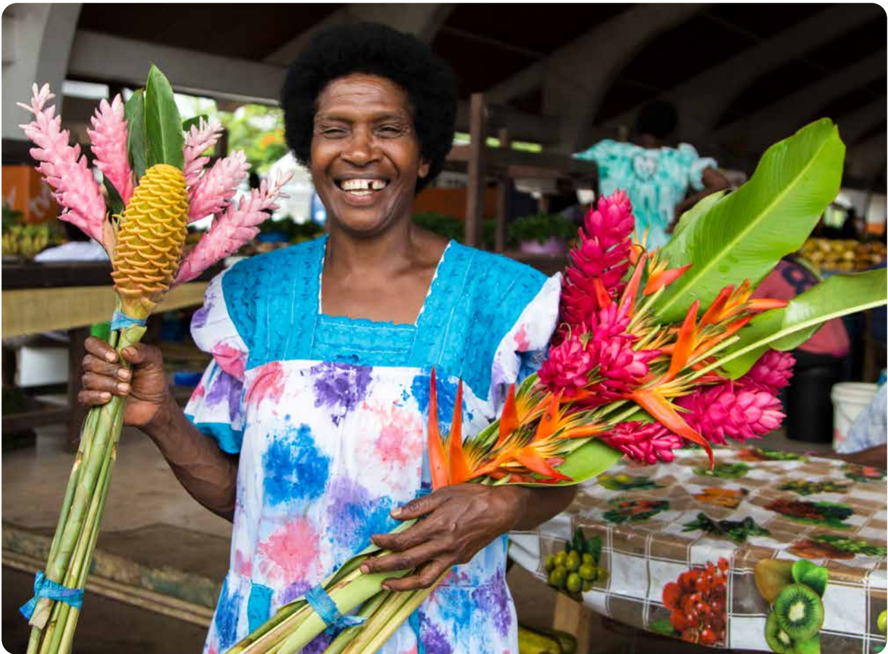
Woman with flowers in a Vanuatu market. Safe and inclusive markets help build community resilience.